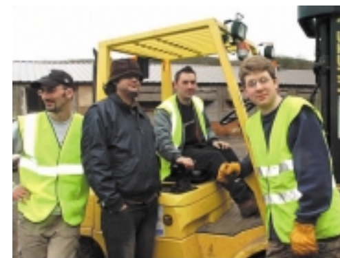
New Kerbside employees.

Thank You for supporting your Kerbside Recycling Service