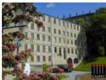
Central Park, Spring Edge, Misc

Thank you to everyone at Calrec Audio in Hebden Bridge who have helped us in many ways including putting this newsletter together.